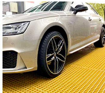
Car washing shop